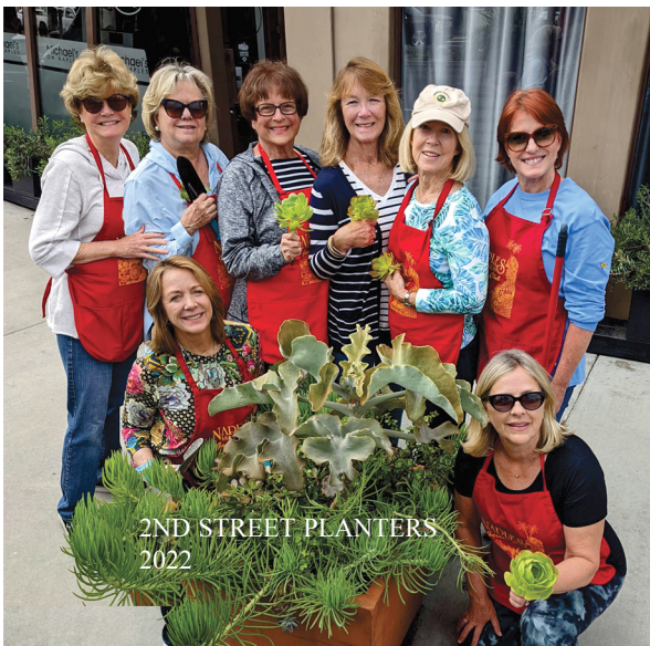
2ND STREET PLANTERS 2022