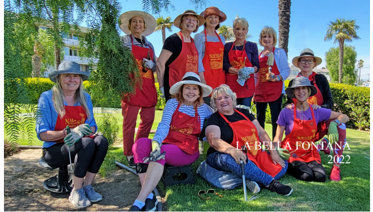
LA BELLA FONTANA 2022

Make no mistake, the goals and accomplishments of the Naples Islands Garden Club are heady! Beautifying our islands, maintaining our iconic fountain, enhancing our neighborhood school, honoring our veterans, providing scholarships and funding other projects is what ensures keeping “Naples is Nicer”. While flowers bloom and fade, trees thrive and shed, plants grow and die, the Naples Islands Garden Club has continued to flourish and prosper for 50 glorious years, and it doesn’t show any sign of slowing down. ~ Arleen Tolle, NIGC Celebration Chair