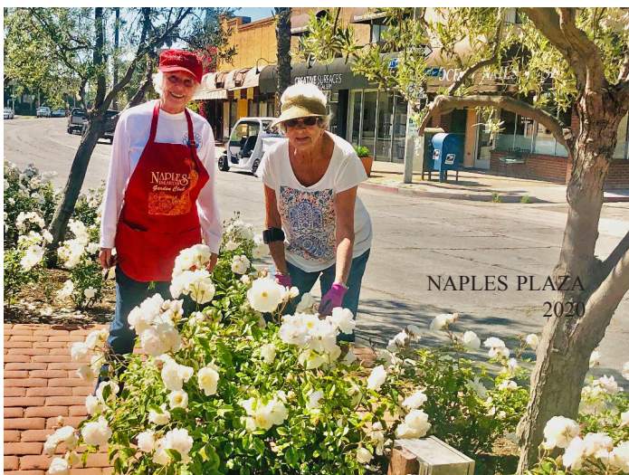
NAPLES PLAZA 2020