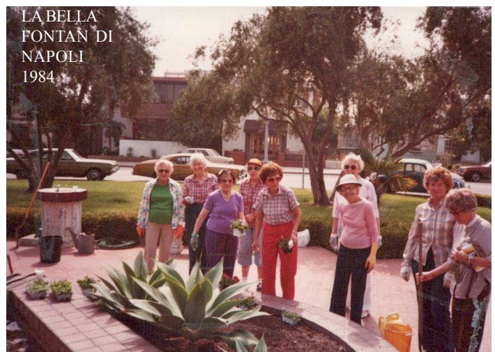
LA BELLA FONTANA DI NAPOLI 1984

The historic park in the center of our islands was first created in 1969, but with the addition of a beautiful fountain, it was dedicated as La Bella Fontana di Napoli in 1971. Originally the design included four (4) half circular raised garden beds, but wind blown chlorine water made it difficult for plants to survive and eventually these rounds were filled in. After the Garden Club's origination in 1973, members rallied to maintain the park's beauty, and this care continues today.