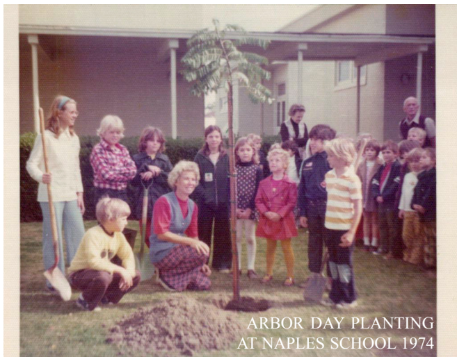
ARBOR DAY PLANTING AT NAPLES SCHOOL 1974

In 1984, as a patriotic gesture to celebrate the LA Olympics, members of the Garden Club planted red, white and blue petunias around the historic La Bella Fontana, pulled weeds from between cracks on the Davies Bridge and painted fire hydrants in red, white and blue. Planting trees for Arbor Day at Naples Elementary School began in these early years and continues to be an annual Club event to remember lost loved ones.