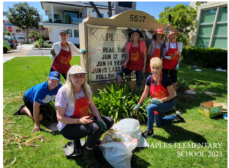
NAPLES ELEMENTARY SCHOOL 2023