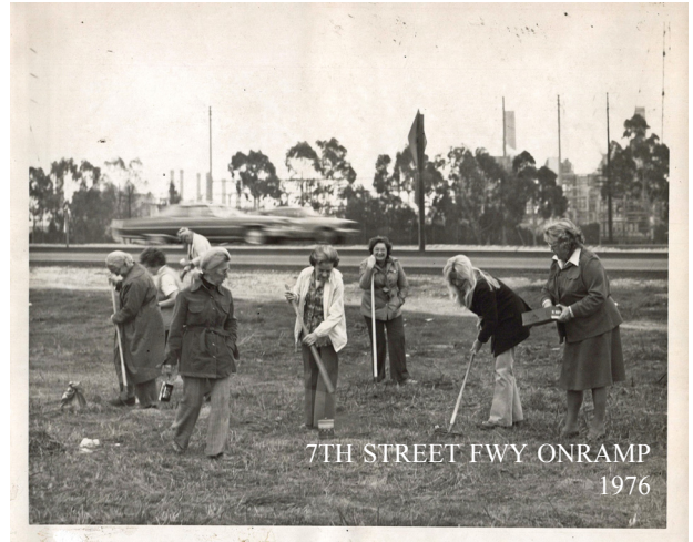
7TH STREET FWY ONRAMP 1976