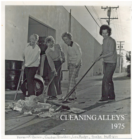
CLEANING ALLEYS 1975