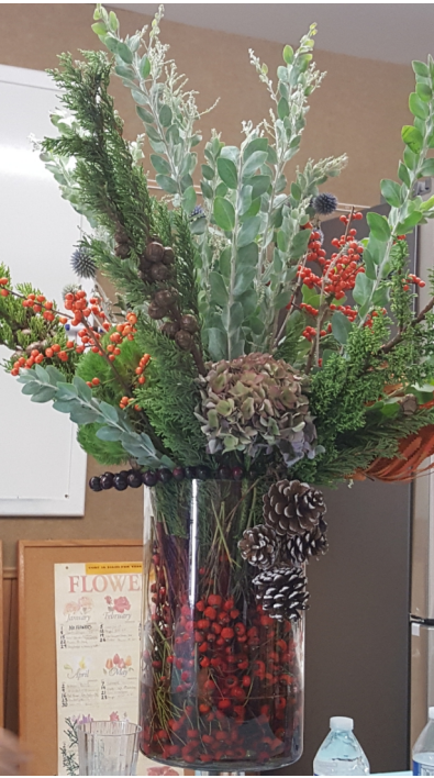
Rose hips in a large glass container conceal stems in a tall arrangement.