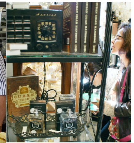
Vintage items are on display for purchasing consideration.