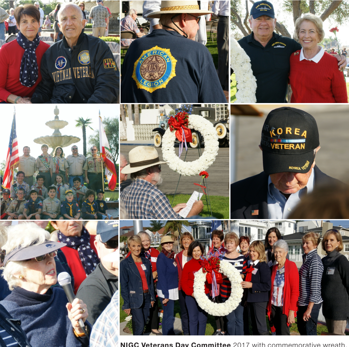
NIGC Veterans Day Committee 2017 with commemorative wreath.