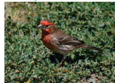
House finch in El Dorado Park