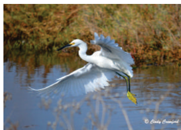
Snowy Egret in flight over Zedler Marsh in the Los Cerritos Wetlands