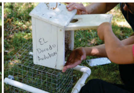
Making sure the chicks do not fall out while checking the nest box.