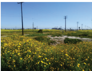
Flowers in the Hellman Lowlands area of the Wetlands (Seal Beach)