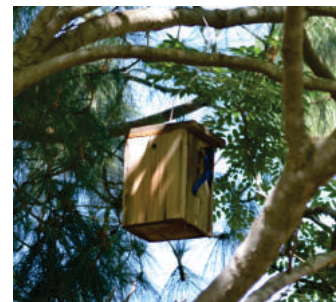
Western Bluebird male watching over the nest box.