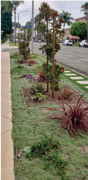
Little Gem magnolias.