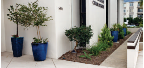
Blue planters, left, contain a Gardenia Patio Tree and a Duranta.