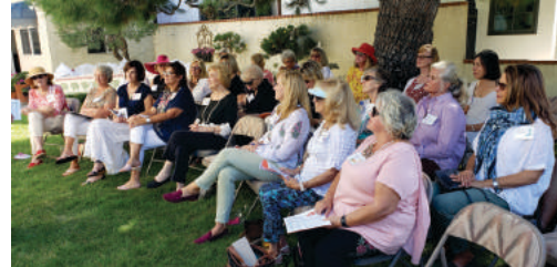
Board members, new members and sponsors gather in the pine tree shade.