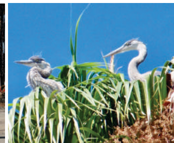
Young GBH in their palm tree nest along Marina Drive.