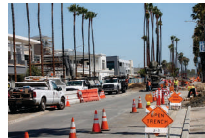
Palm trees preserved along Marina Drive during major construction.