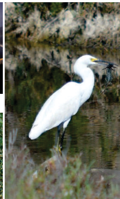
Great Egret finds food in the protected wetlands.