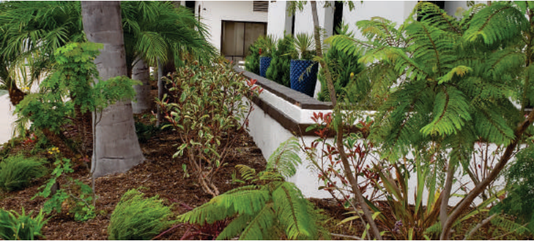
At right in photo, newly planted Jacaranda Tree and along wall, pink tipped Photinia Marble Queen