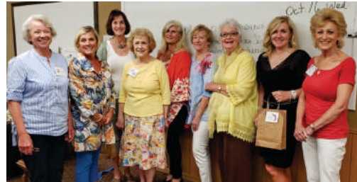
Sponsors with new members were welcomed at the General Meeting.