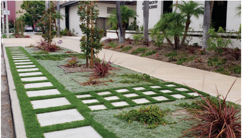
Stunning landscape is welcoming with Cordyline Festival Grass Burgundy, Magnolia, Palms and textural ground cover.