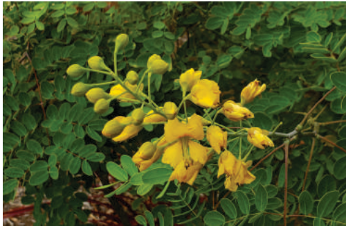
Mexican Bird of Paradise, Caesalpinia pulcherrima .