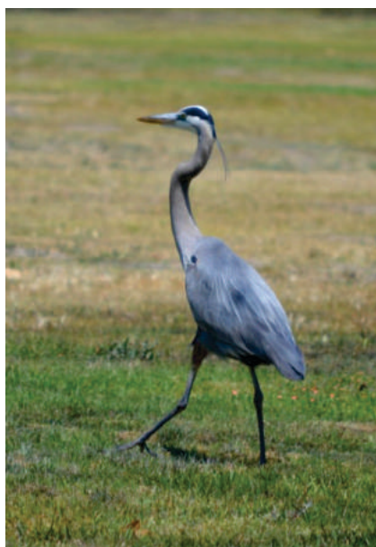
Great Blue Heron in El Dorado Park