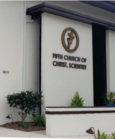
Plant colors of "sand" and dark chocolate brown are chosen in keeping with the church architecture.

~Edie Graber, Beautification Award Chair Much praise is given to the restoration of this mid-century building! Landscape designer, Karen Holt, explained the theme as a paradise of coral reef by day and night. The colors and shapes were planned to reflect the nearby sea. Jacaranda trees, Sea Statice, Tuscan Blue Rosemary and blue pots are a stunning contrast to multiple green shades of succulents, Snow Bushes, Red Riding Hood Tea plants, Photinia Marble Queen and burgundy Festival Grass. Several types of camellias including Japonica and Bella Rosa will blossom for more color. In front, square stepping stones in different sizes, interspersed with textured turf, add sidewalk appeal and a practical walkway from the street. Dymondia serves as a hardy ground cover. The beautiful Magnolia tree has been repeated around the building and many other trees and plants make this one year project a lovely addition to our neighborhood! Do take time to walk around this lovely site day and night!