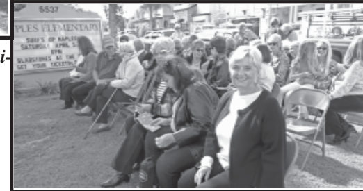
Arbor Day supported by many members, family and friends