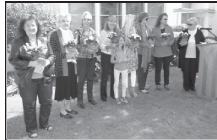
Members and family members receive potted flowers in remembrance of their loved ones.