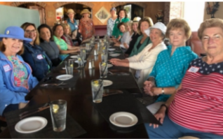
Walkers' post tour lunch at Piccarelli's Restaurant.