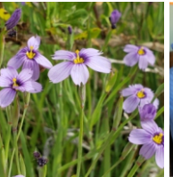
"Best wildflower bloom in years"