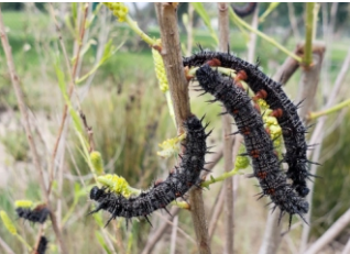
Voracious caterpillars were not deterred by curious visitors