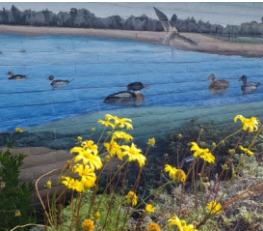
The mural on the Education Building is framed by wild flowers.