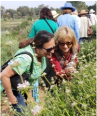
Abundant wild flowers throughout the Lagoon.