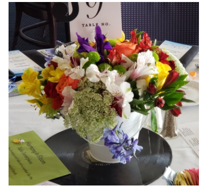
"Harmony In Bloom" centerpiece.