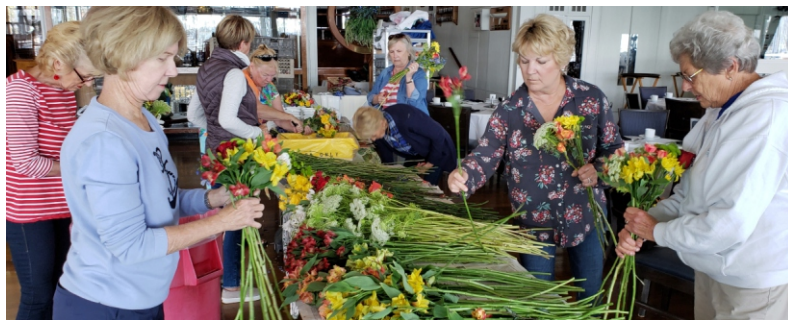
Flower Show committee prepared the table centerpieces the day before the Event