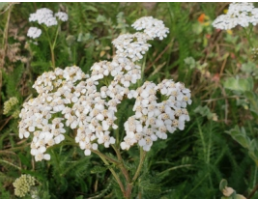
Erigonum fasciculatum, California Buckwheat