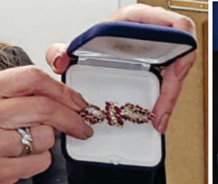
Antique ruby & diamond earrings were re-used to create this lovely pin.