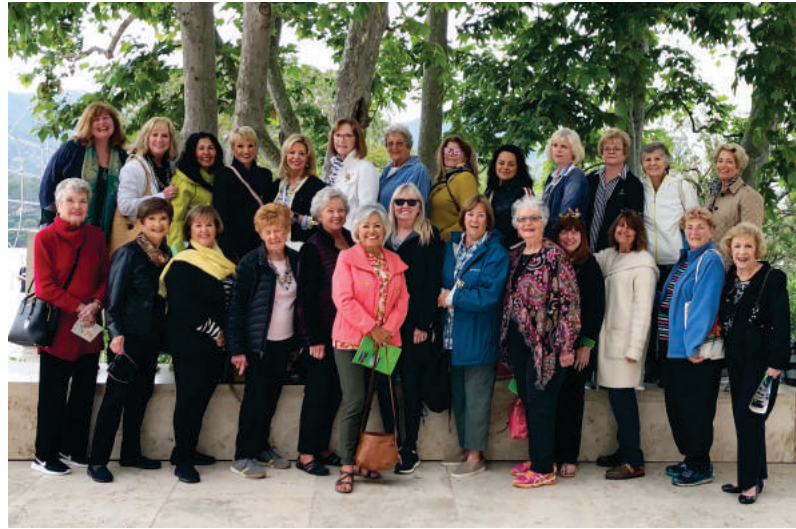
Above: Upon arrival at the Los Angeles Getty Center, twenty-six Garden Club members gathered for a memory of all present. Above right: Succulents with spots of bright color greet visitors to the Center.