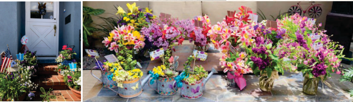
Beautiful May Day bouquets and doorways were a special way to share this thoughtful celebration of kindness.