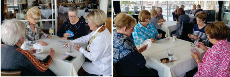
NIGC Bridge Club players concentrate on the hand dealt