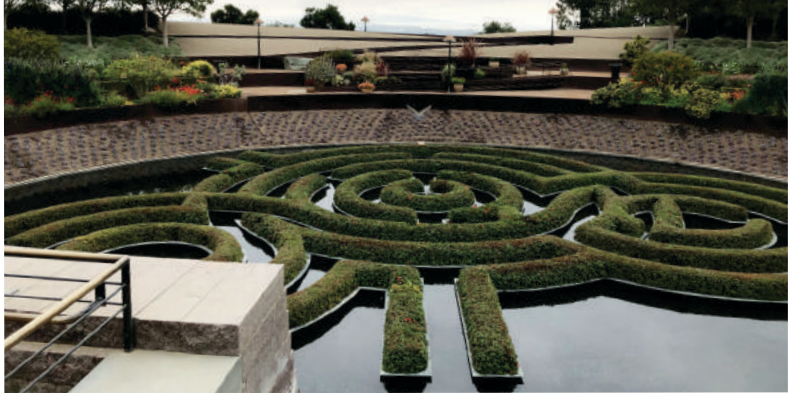
Artist Robert Irwin's Central Garden overlooks the City of Los Angeles.