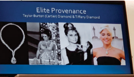
A famous diamond has been redesigned over the years for famous actresses.