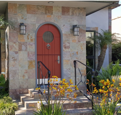
Yellow Kangaroo Paw accents the stairway at the tiled front entrance.