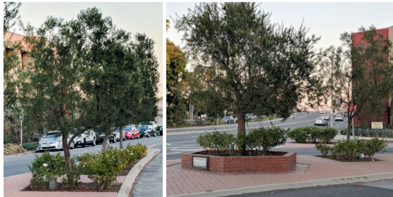
Trees and rose bushes flourish in the Naples Plaza entrance medians.