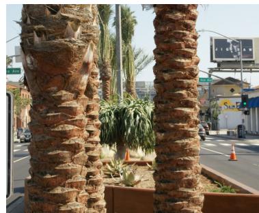
Improvements and maintenance of the Belmont Shore Medians will be paid for with parking meter revenue.

Naples Seawall update; The 2nd phase is fully funded and a plan for the Sorrento Trail has been completed. It addresses the residents' concerns as well as Coastal compliance, which should have a hearing within the next 6 months. (continued pg. 7)