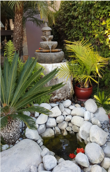
Asian water fountain tumbles into a rocky stream bed.

Monique has created a tranquil Asian garden with soothing water features and dry stream beds. There are pygmy and sago palms, a variety of ferns, and mondo grass. Yellow kangaroo paws, orange day lilies and clivia provide color accents. Tucked away in the corner is a bench complete with pillows that the neighborhood cats find irresistible. As you look around the garden you will notice meticulous attention to detail. There is a playful orange fish planter filled with succulents, slate tiles imprinted with fish and shells surround the doorway. The yard is low maintenance which gives Monique more time to spend with her dogs Georgie and Issie.