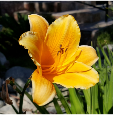
Eye-catching day lily.