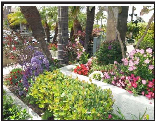
212 Rivo Alto Canal

The three-tiered garden bordering Lynn Gesner's corner property is a perfect blend of mature palms and pittosporum Silver Sheen enhanced by single and double fuchsia, snowbush, statice, hydrangea, salvia and variegated geraniums. Along the seawall, multi-trunked pygmy palms are set off with fuchsia and begonia at the base.