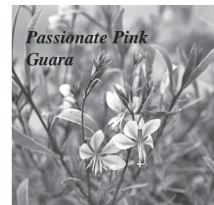
Passionate Pink Gaura

In addition to the natives, succulents have a separate and thriving section