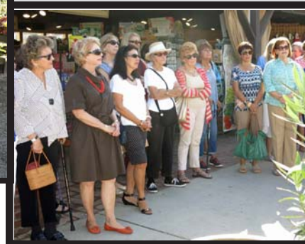
Members listen intently to speaker.