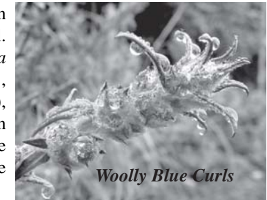
Woolly Blue Curls