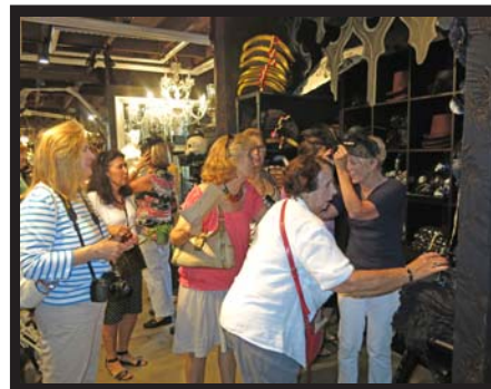
In the Halloween section, much hilarity prevailed with members trying on masks and hats!