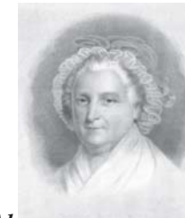
Above: Martha Jefferson, left, and Martha Washington, right.