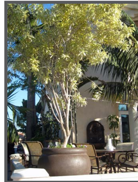
Song of India in enormous ceramic pot!